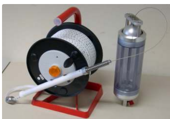
KLL-S sampling system with KLL